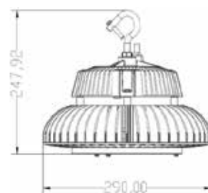
Dimension of 60° alum reflector